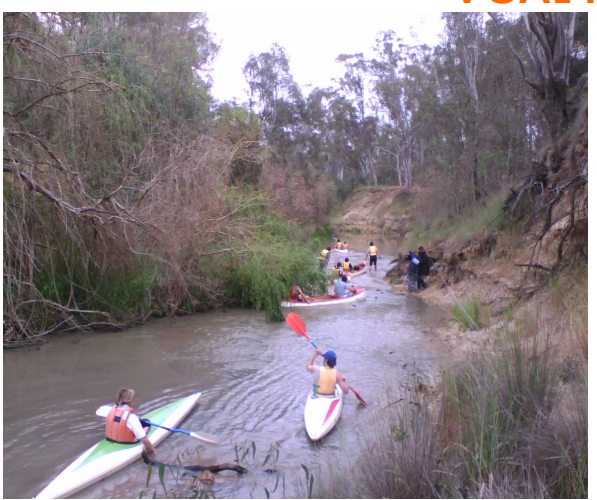
Wanganui Park Secondary College VCAL students on a canoe water testing excursion

The first year of the RiverConnect VCAL Personal Development unit for both Notre Dame and Wanganui Park Secondary colleges concluded with the end of 2007.